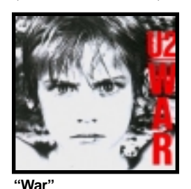
(1983: Island Records)