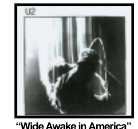
(1985; Island Records)